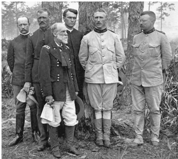
Group portrait of Theodore Roosevelt and other high-ranking officials of the 1st U.S. Volunteer Cavalry Regiment - Tampa, Florida.

The State Archives has few records that document Florida's involvement in the Spanish-American War and the experiences of Florida's citizens at the time. The records include traditional military records such as muster rolls and compiled service records as well as correspondence and photographs.