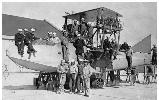
Curtiss aircraft crewmen - Naval Air Station Pensacola.

The State Archives has a variety of records that document Florida's involvement in the Mexican Punitive Expedition and the First World War, as well as the experiences of Florida's citizens at the time. The records include traditional military records such as draft records and rosters as well as maps, diaries, letters and other personal papers.