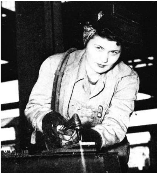
Woman welding for the Saint Johns River Shipbuilding Company - Jacksonville, Florida.

Of the 16 million Americans who served in the war, more than 250,000 were Floridians, and thousands more contributed to the war effort at home. They volunteered for civil defense tasks like patrolling the coastline and watching the skies for enemy aircraft. Families conserved food and collected scrap metal and other materials to be recycled into goods for the war effort. Agriculture became more important than ever, as did the state's shipbuilding industry.