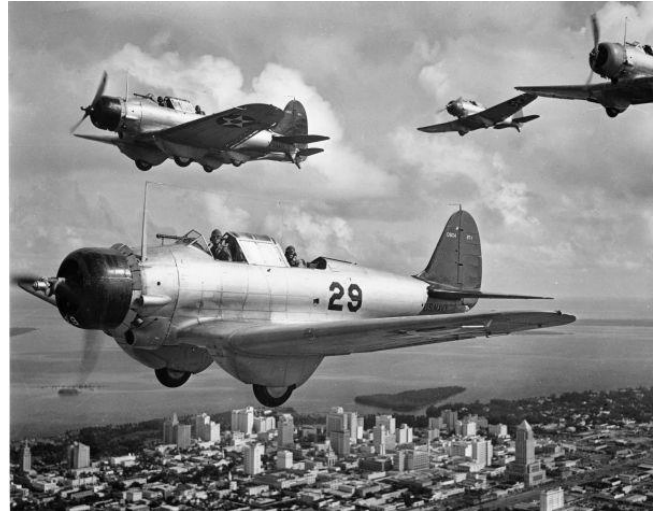
View showing U.S. Navy dive bombers flying over Miami during WWII.

Florida's large swaths of land, warm climate and extensive coastline made it ideal for training hundreds of thousands of military recruits, particularly in aviation and amphibious landing operations. In just a few years, the federal government established more than 170 military installations of various sizes, including major bases like Camp Blanding, which became Florida's fourth largest city during the war.