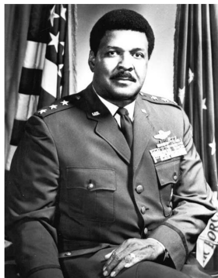
Air Force General Daniel "Chappie" James.