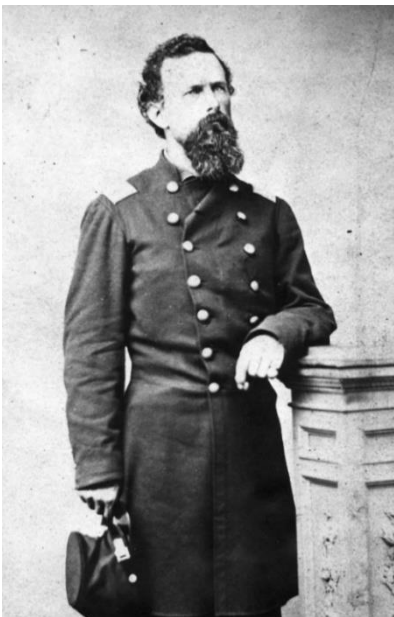
Portrait of Union Brigadier General Joseph Roswell Hawley

The State Archives has a variety of records that document Florida's involvement in the Civil War and the experiences of Florida's citizens at the time. The records include traditional military records such as compiled service records and pension applications as well as maps, diaries, letters and other personal papers.