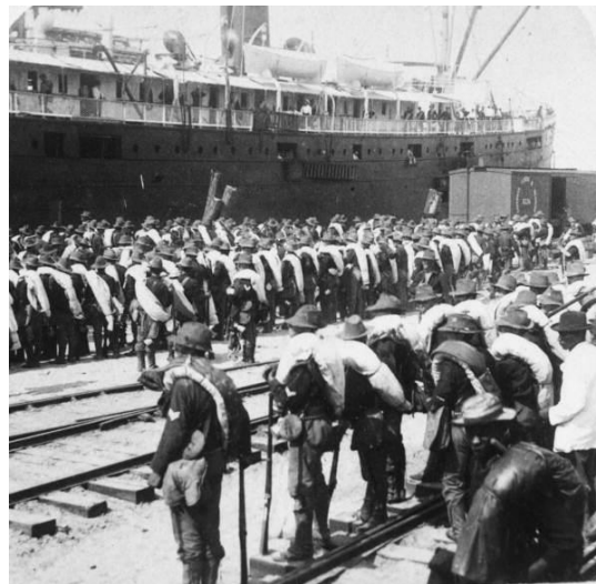
8th U.S. Infantry ready to embark for Cuba